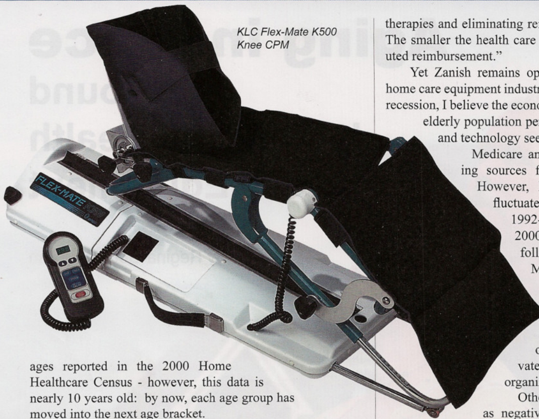
KLC Flex-Mate K500 Knee CPM

ages reported in the 2000 Home Healthcare Census - however, this data is nearly 10 years old: by now, each age group has moved into the next age bracket.